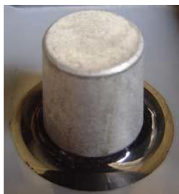
AP ( Automotive Post)