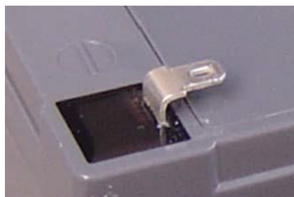
F2&F1 ( Fasten Tab 250&187)