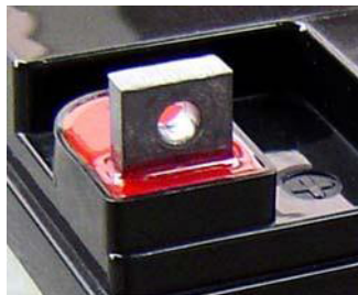
F25 ( " L " Terminal)