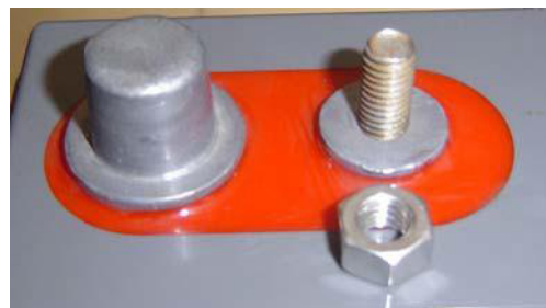
DT ( AP and Stud Terminal)