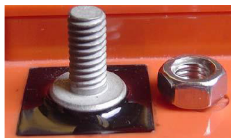
M6 M ( Male Stud Terminal)