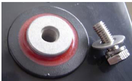
M5、 M6 or M8 ( Button Terminal)