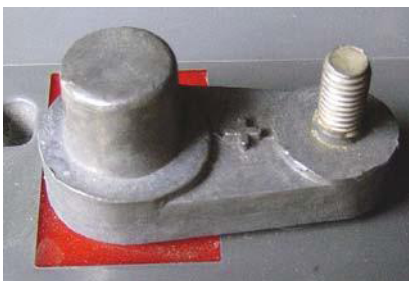
APW ( Marine Dual Terminal)