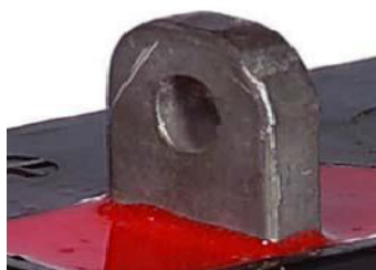
F7 ( " L " Terminal)